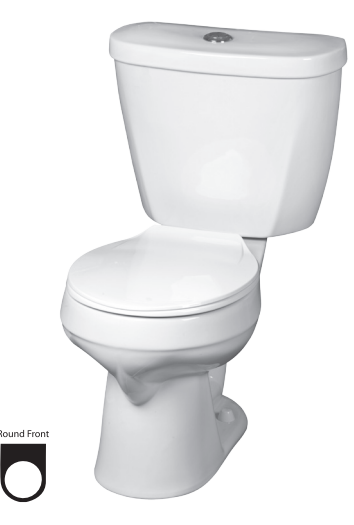
Model 380-3386 Toilet seat not included