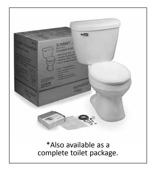
Model 380-387 Toilet seat not included